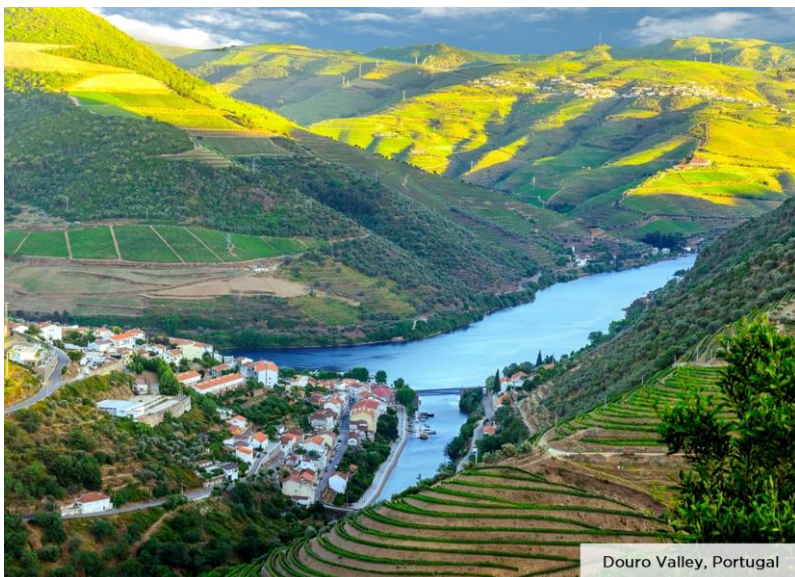
Douro Valley, Portugal

Choose from $750 off per person or FREE LAND Reserve by January 31, 2024